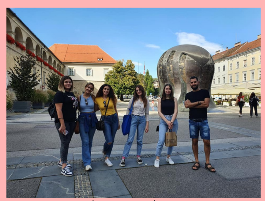
Maribor, September 2021